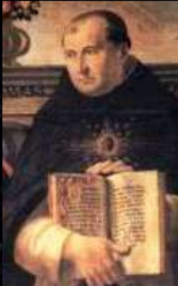
Thomas Aquinas - 13 th Century theologian

“There must be an ‘unmoved Mover’ to begin all the motion in the universe. A first domino to start the chain moving, since mere matter never moves itself.”