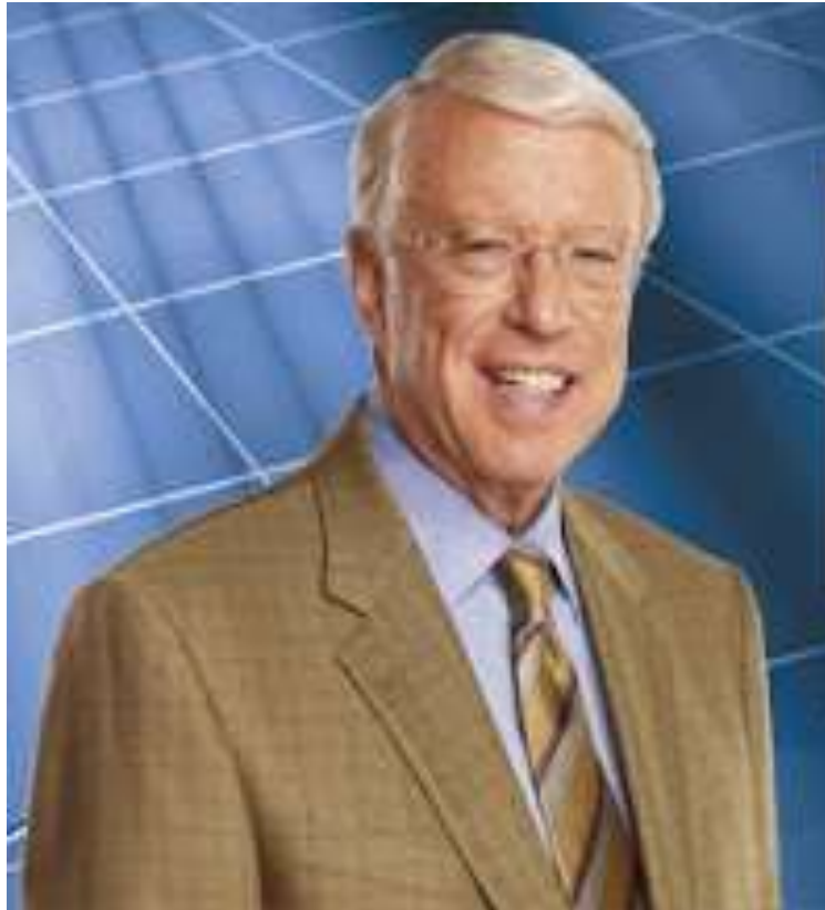
Dr. Neil Clark Warren, PhD