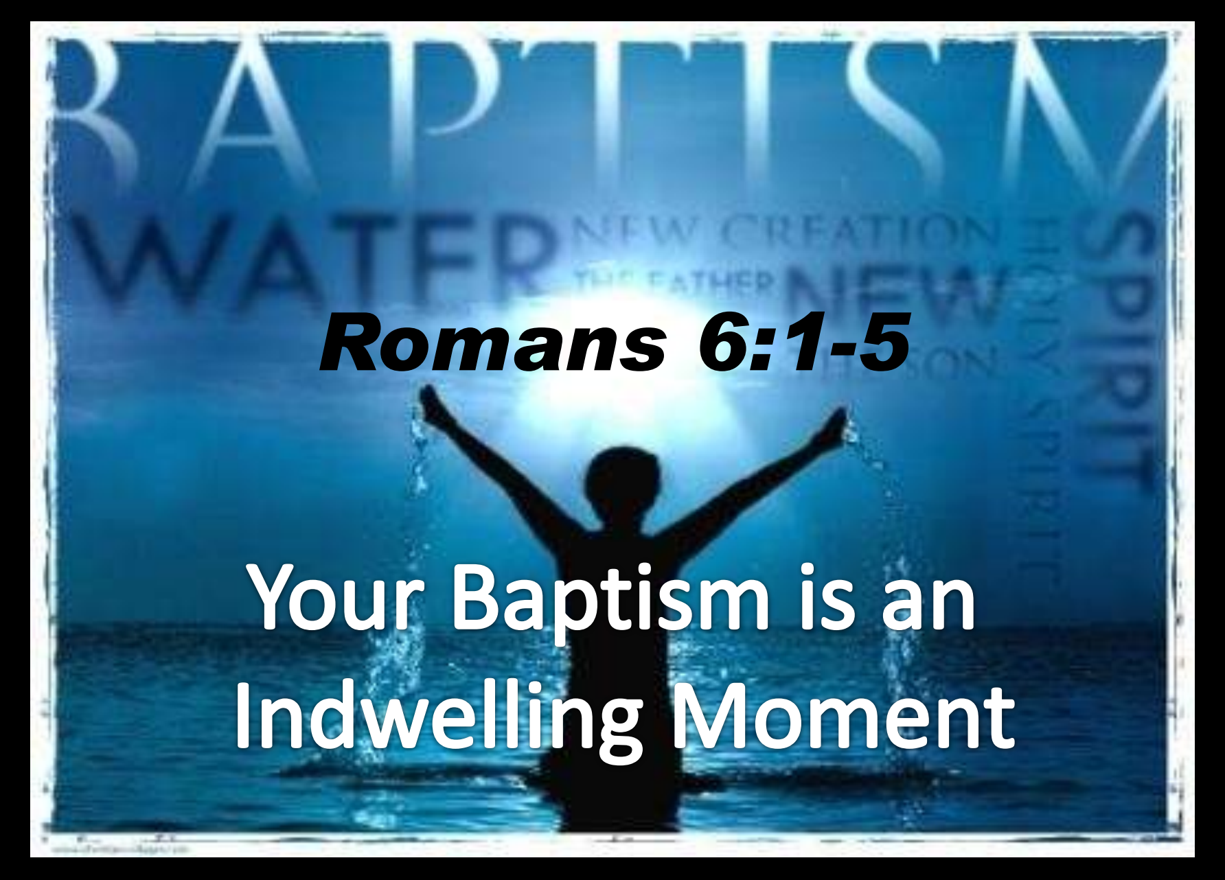
Putting "App" Back in Baptism