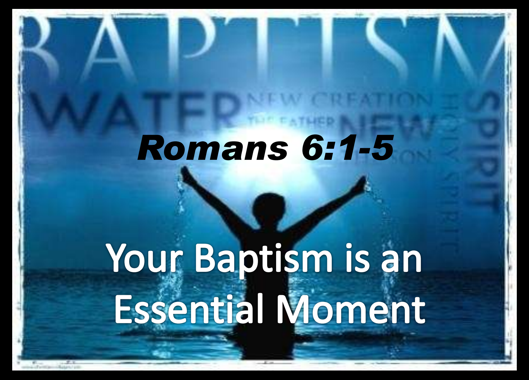
Putting "App" Back in Baptism