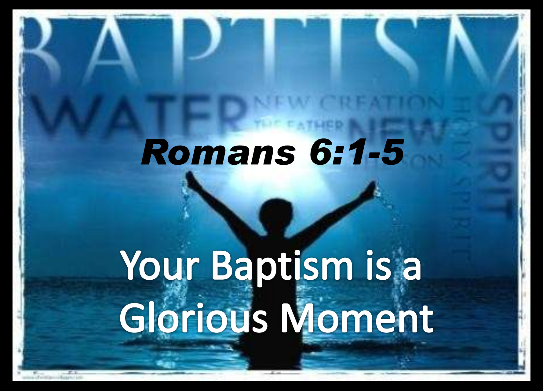
Putting "App" Back in Baptism