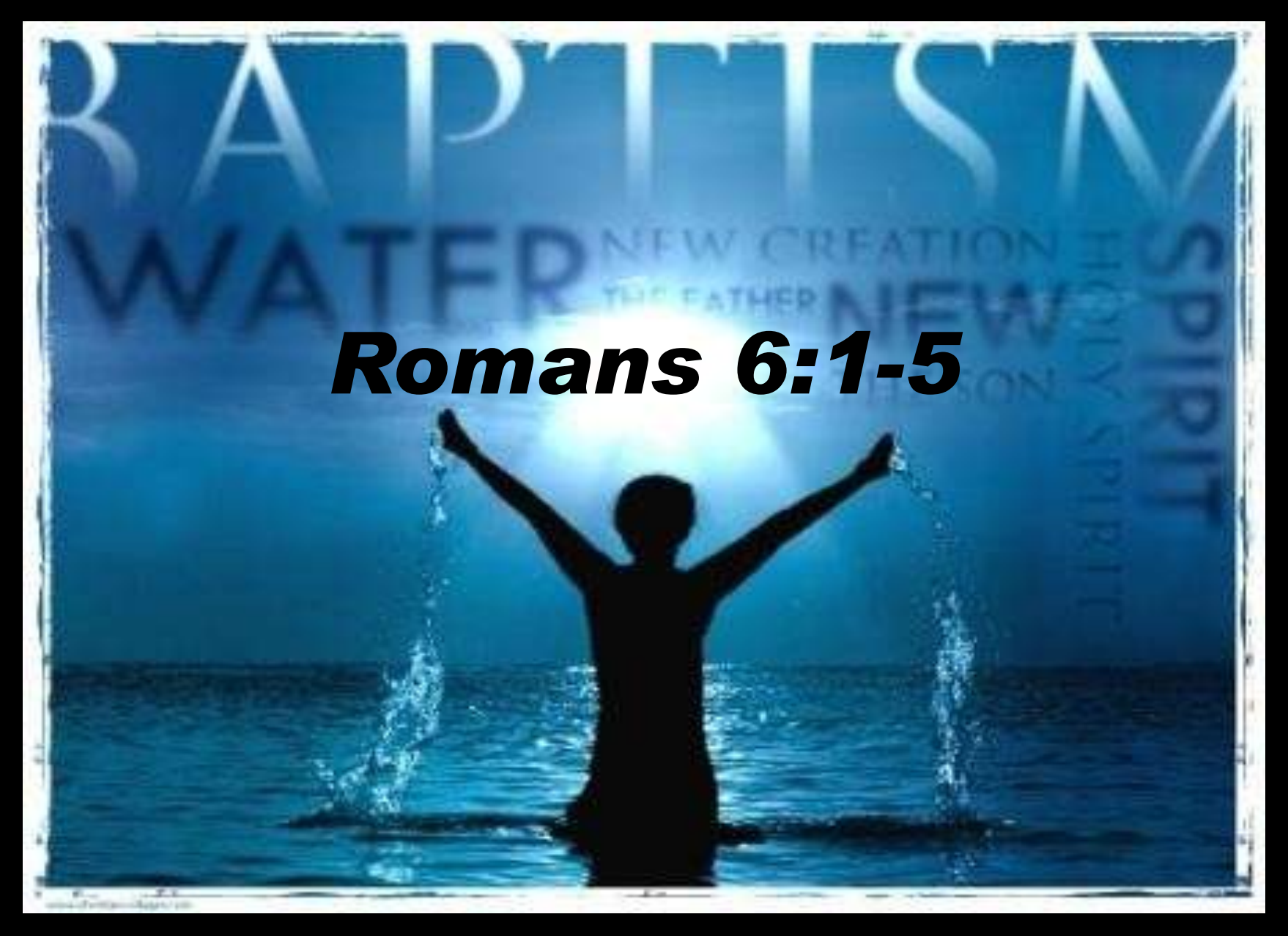
Putting "App" Back in Baptism