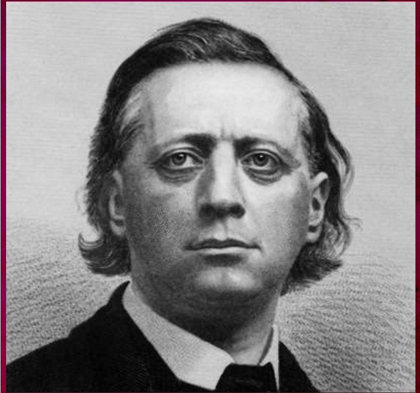
HENRY WARD BEECHER

“When God thought of mother, he must have laughed with satisfaction and framed it quickly—so rich, so deep, so Divine, so full of soul, power and beauty was the conception.”