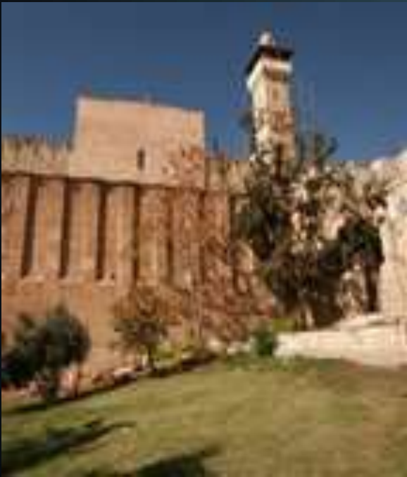
Modern day site